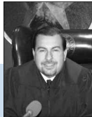
Judge Robert Ramirez County Court at Law No. 2

The Honorable Robert Ramirez stated his court hears civil cases with less than $100,000.00 in controversy and requests for occupational driver's licenses. Some of Judge Ramirez' preferences include: